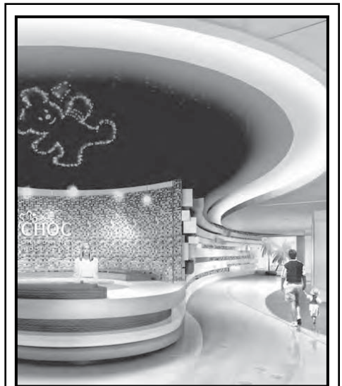
Designed to be modern and inviting, the new tower will feature open, colorful spaces and a spacious new lobby.