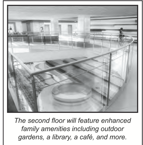
The second floor will feature enhanced family amenities including outdoor gardens, a library, a café, and more.

The most advanced building construction techniques are being utilized to construct the tower, including a three dimensional computer software model to coordinate the building's electrical, plumbing, mechanical and other related systems. This process eliminates above ceiling conflicts and ensures that these systems are installed in a quality manner, prior to construction.